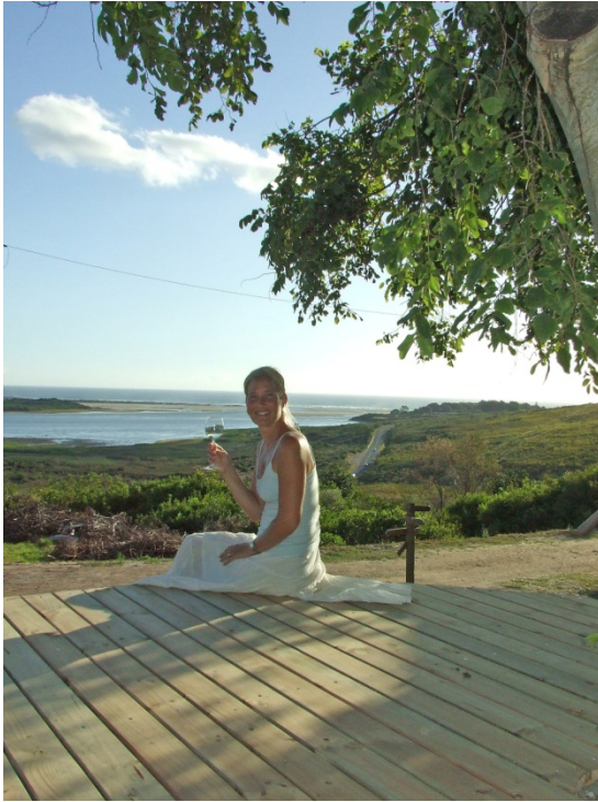
Figure 2- having sundowners at "The White House"

Many of our members lead hectic lives in the Mother City and when it comes to wanting to hike, they cannot get out of town early enough to spend more quality time in the fynbos. Well now you can! Leave after work on a Friday and book into either The White House or Buys se Huis at Vogelgat. The White house sleeps two adults comfortably, with a sleeper couch for any juniors. We have revamped the "House" to include en suite shower toilet as well as a self catering kitchen..only for R300 per night inclusive of bedding! If you require more accommodation book into Buys se Huis , this self catering cottage sleeps 2 adults and two children (on a sleeper couch). The sweeping views of Walker Bay and the peacefulness tucked away from prying eyes is priceless...talk to our members who have shared this experience. Only R400 for the cottage per night, inclusive of bedding. One could also utilise these premises if you have friends visiting from out of town as extra accommodation.